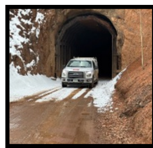
Pictures of the Pioneer Rally's first official vehicle heading out to find exciting new routes and tracks for you to enjoy come September!